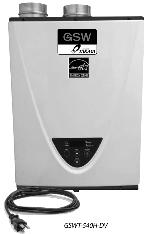
GSWT-540H-DV Condensing Model Shown